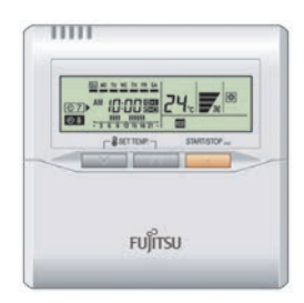
UTY-RNNYN Wired Remote Controller